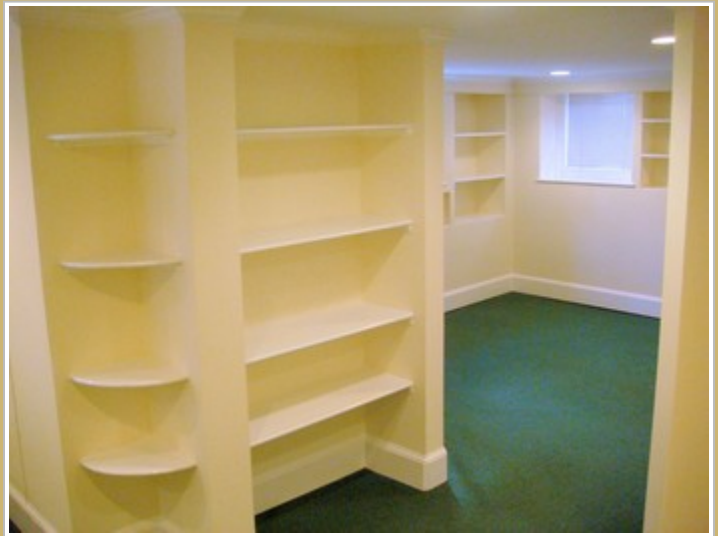
Bookshelf & View Of Office