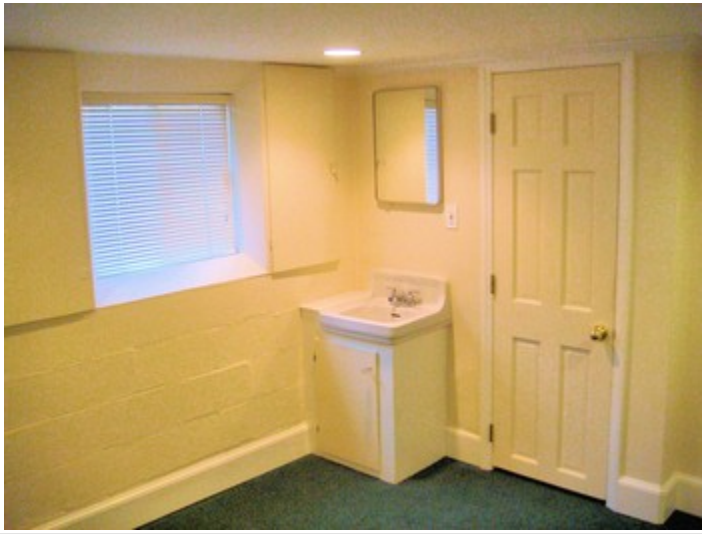
Office Features Vanity, Sink, & Bathroom W...