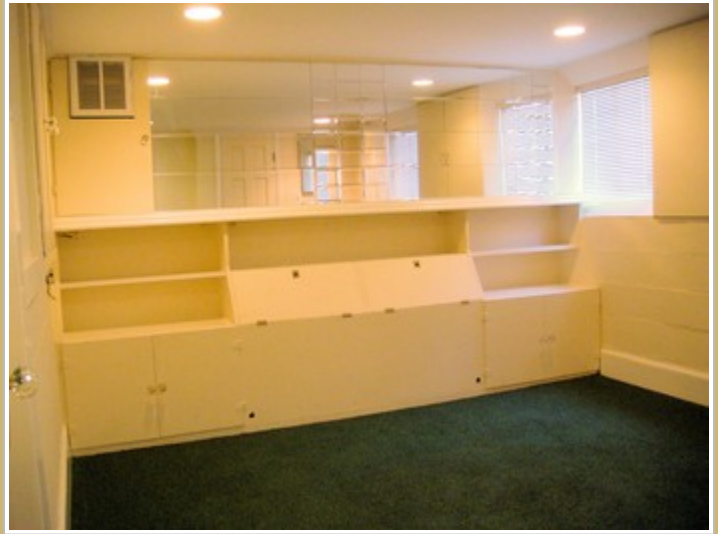
Attractive 11' X 11' Office With Built In ...