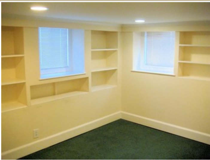
View of 2nd Office With Customized Shelvi...