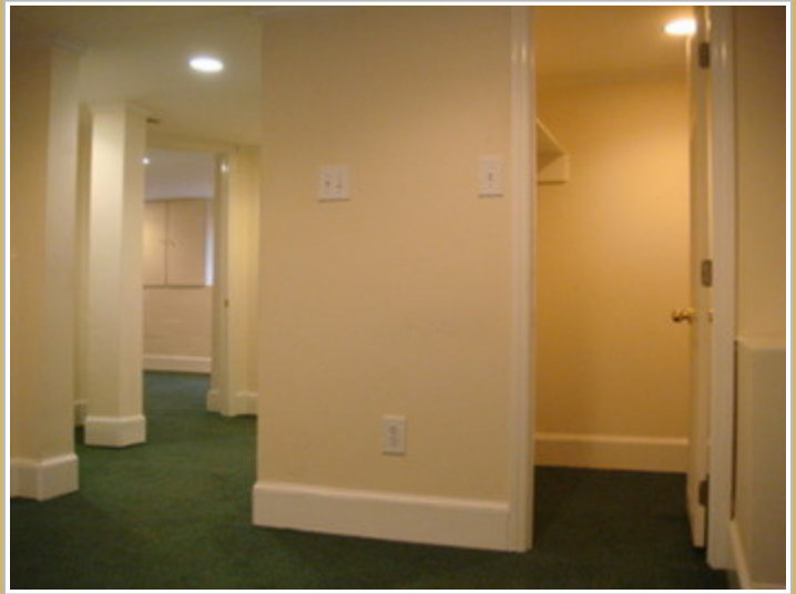
Multiple Storage Areas Including 5' X 5' ...