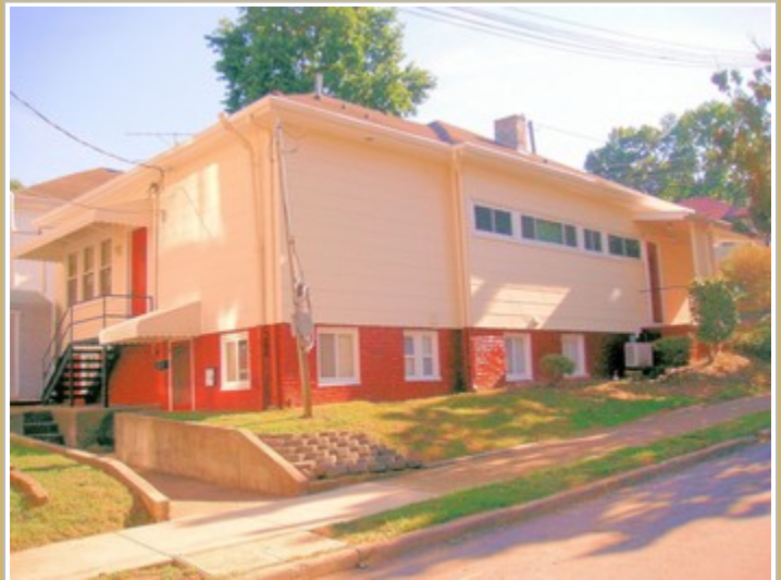
View of Rear Corner and Side Of Building