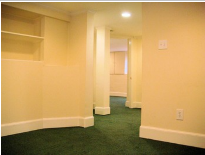
Ground Level View Of Archways to Both Offi...