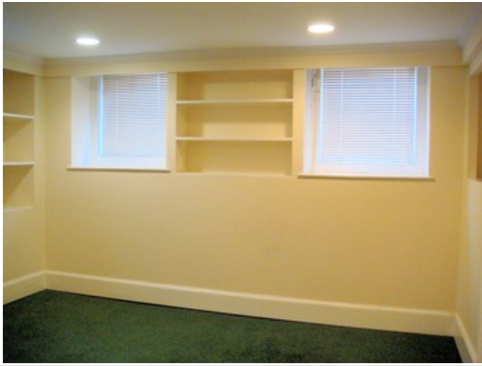
View of 2nd 11' X 11' Office With Shelvin...