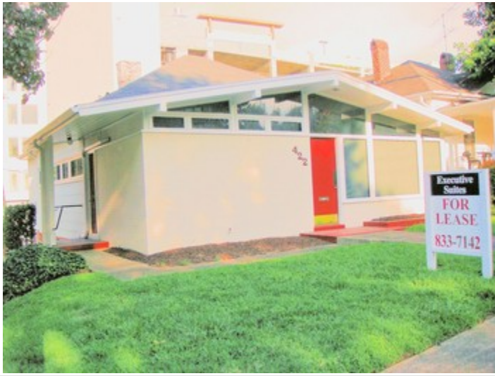
The Front Of The Building on Saint Mary's ...