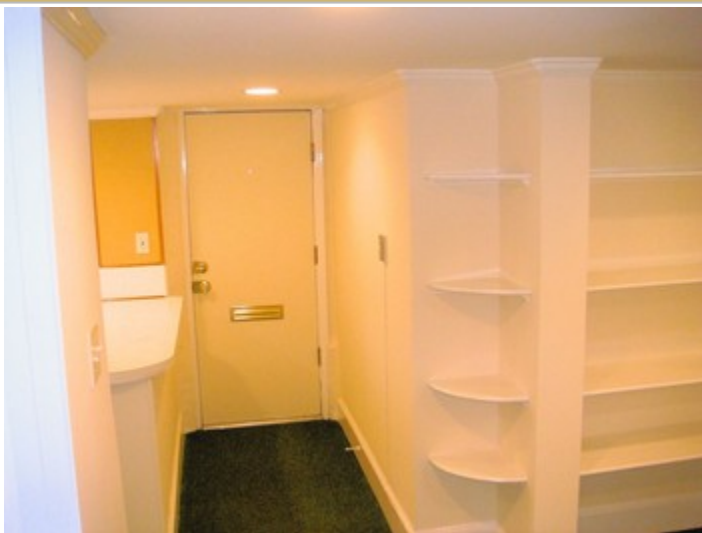
Entry Door To Suite #7