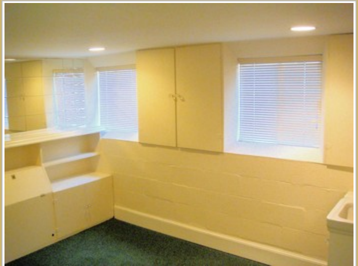
Outside Wall Of 1st Office With Track Ligh...