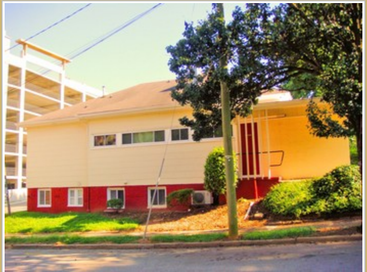
Side View Of Building From Tucker Street