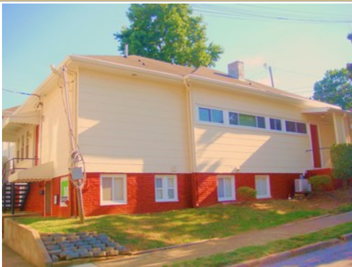
Another View Of Side Of Building Facing Tu...