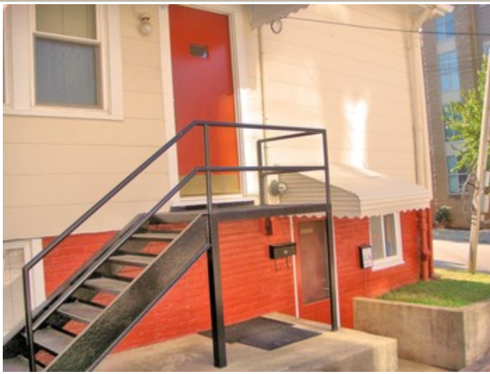
View Of Rear Entrances To Office Building