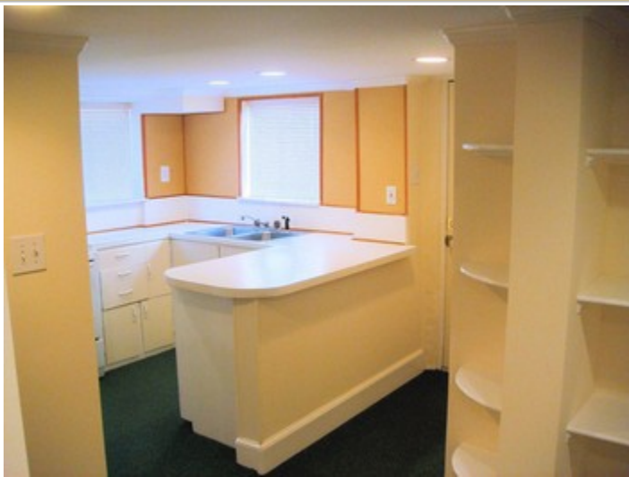
View Of Kitchen (With Stove & Refrigerator...