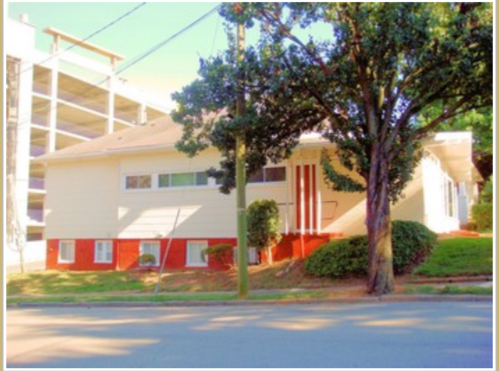
Side View Of Building With Off Street Park...