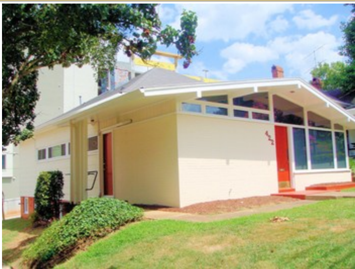
Front View Of Building On Saint Mary's Str...