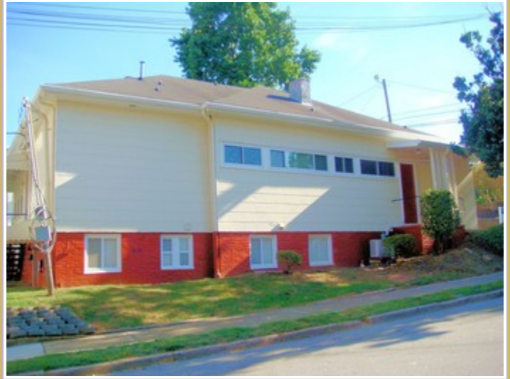
View Of Building With Windows And Off Stre...