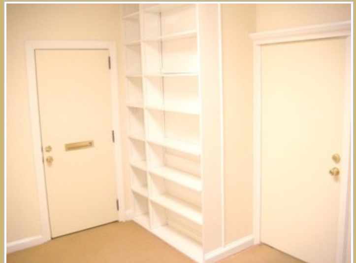
Built in Bookshelves with 12' Ceilings