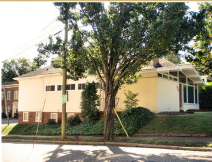
Front Corner of Building