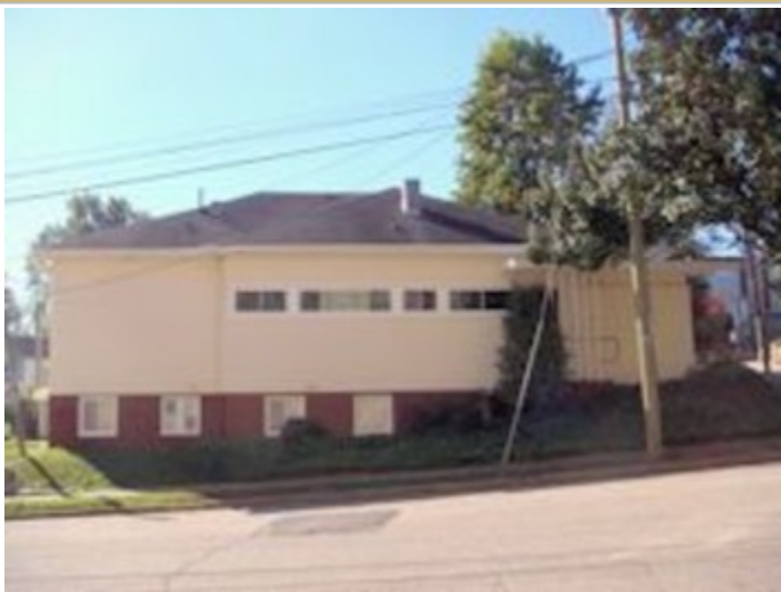
Side of Building facing Tucker Street