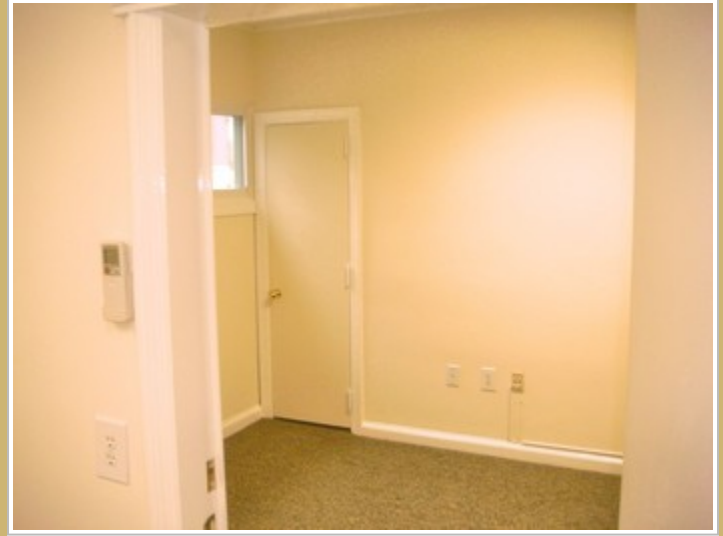
View of Office 1 from Office 2