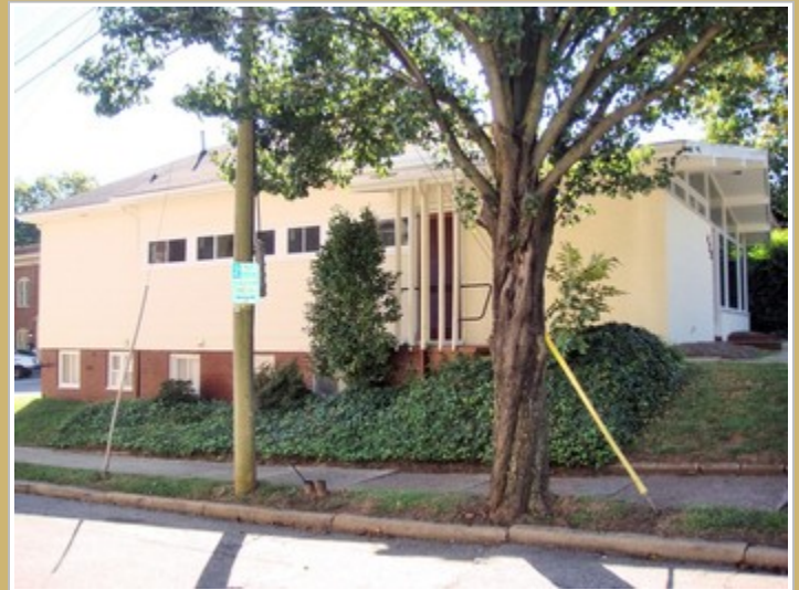
Side of Building - Entry Door to Suite 6