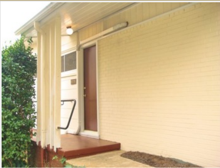
Private Entrv Door to Suite 6