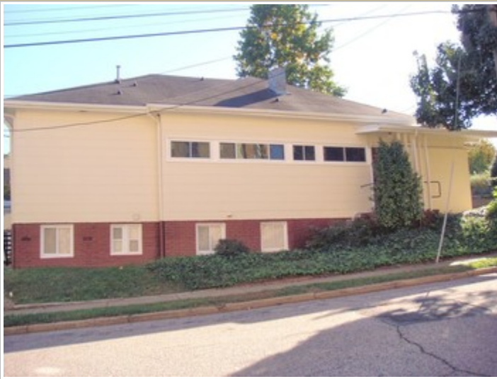
Side of Building