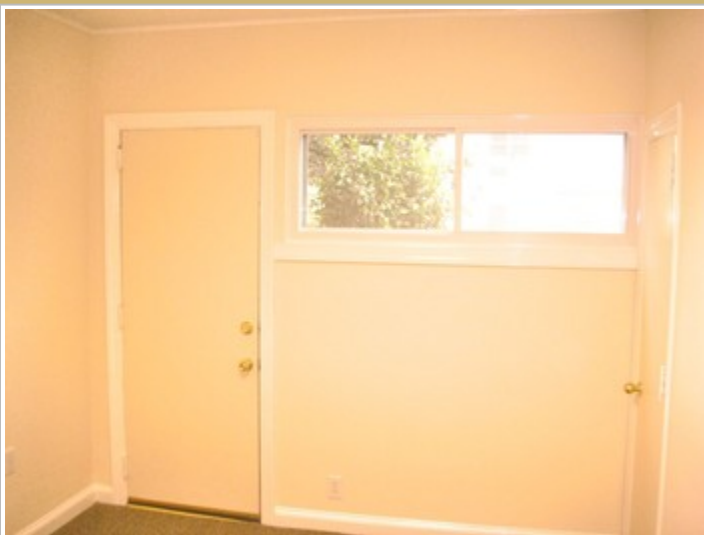
Office 1 - Vinyl Windows