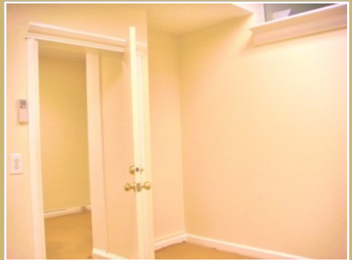
View of Office 2