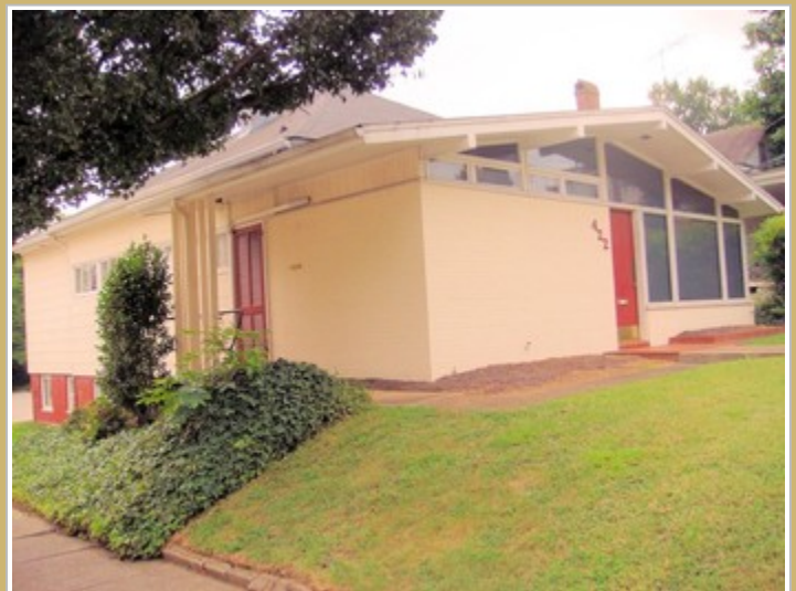
View of Entry Door to Suite 6