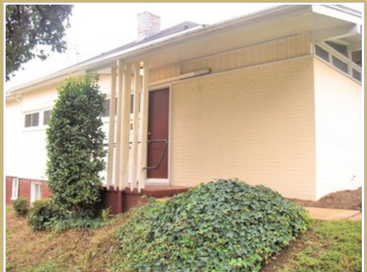
Private Entry Door to Suite 6