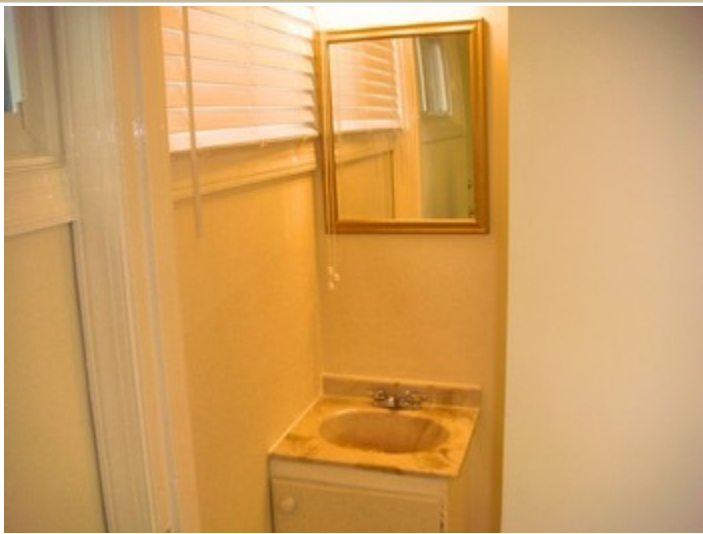
Private Bathroom in 2 Suite Office