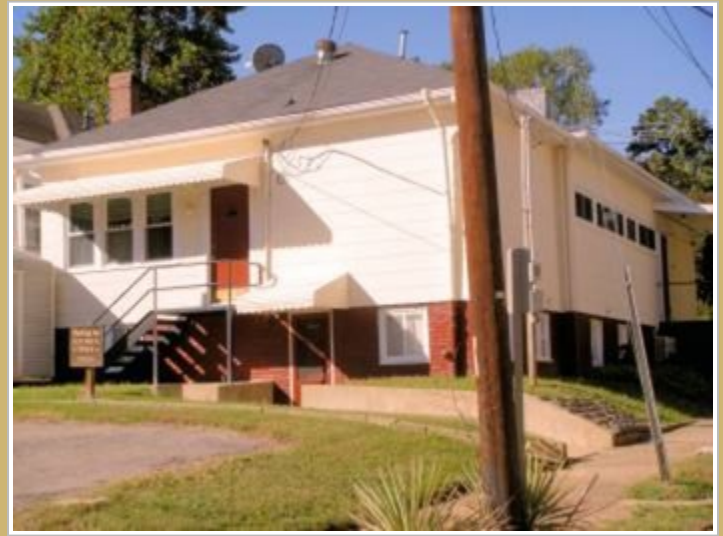
Rear View of Building