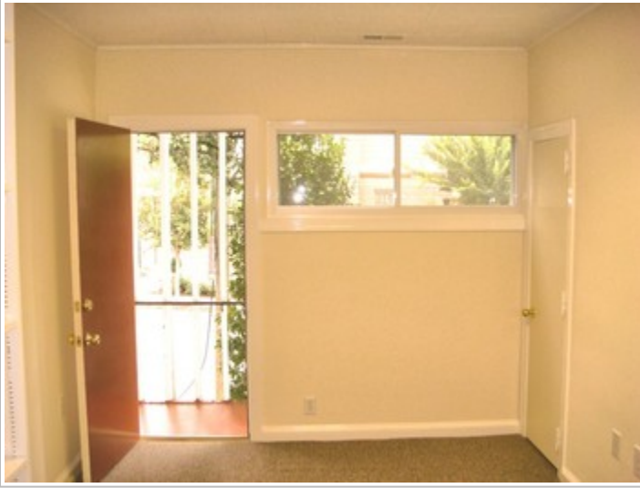
Office 1 - Private Entry Door From Street