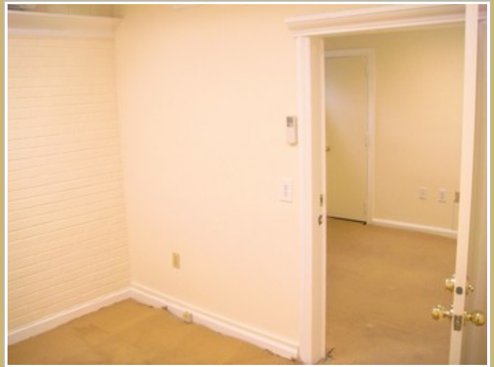
View of Office 1 from Office 2