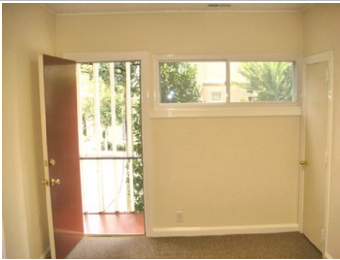
Office 1 with Private Entrance