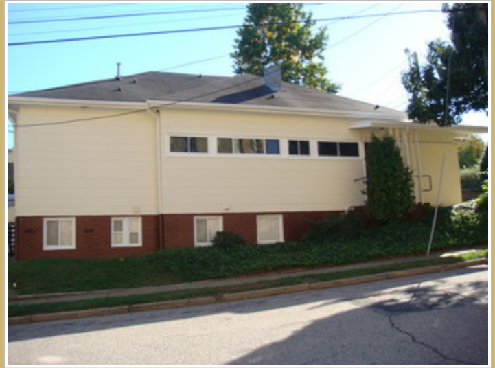
Side of Building facing Tucker Street