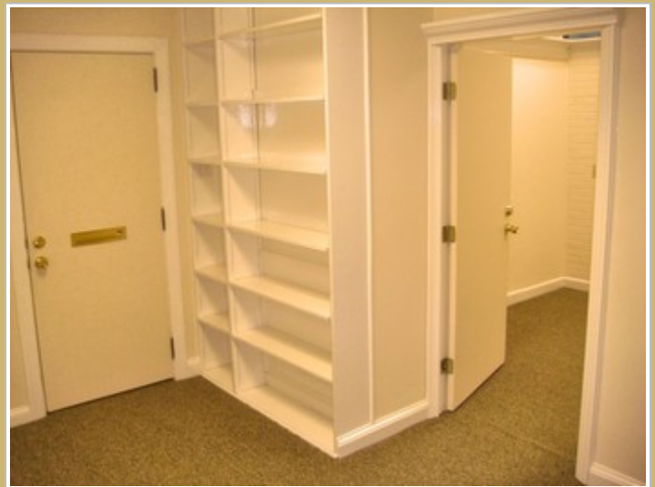
Office 1 with Door Open to Office 2