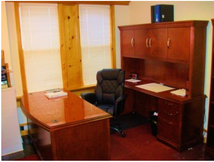
Nice View of Desk and Windows