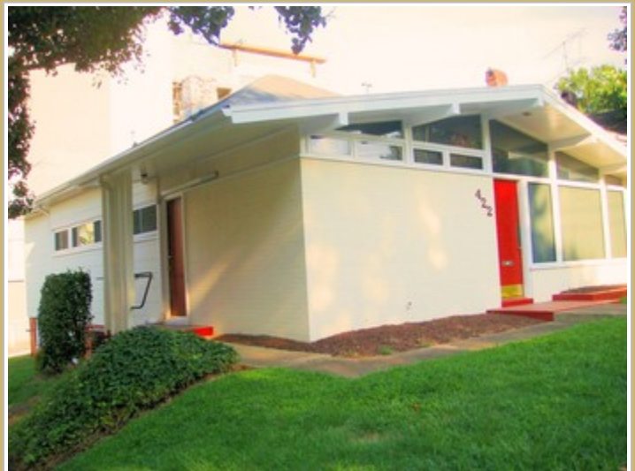
Another View of Front and Side of Building

PAUL JANSEN | DAY - 919-833-7142 | PJANSEN@JANSENPROPERTIES.COM