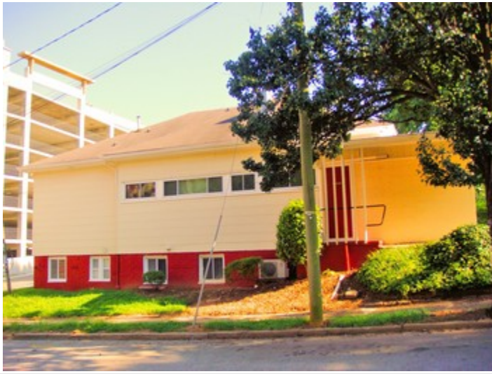
Side View Of Building