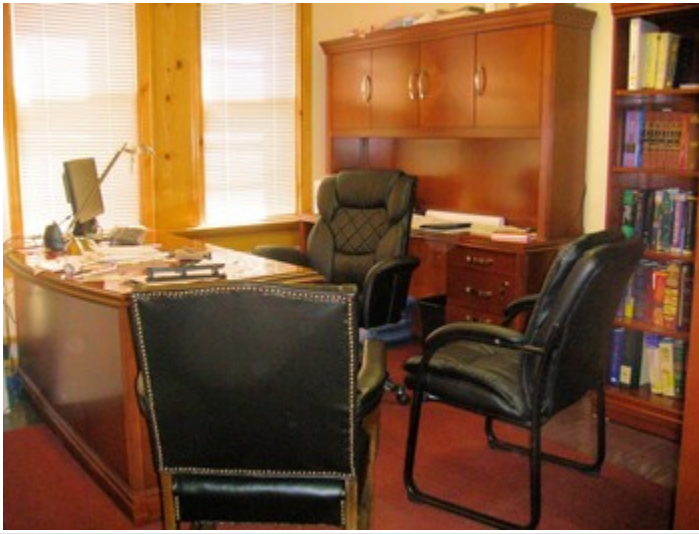
Furniture and Three Chairs