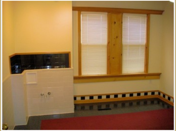
Suite 2 Left Wall - Decorative Tile