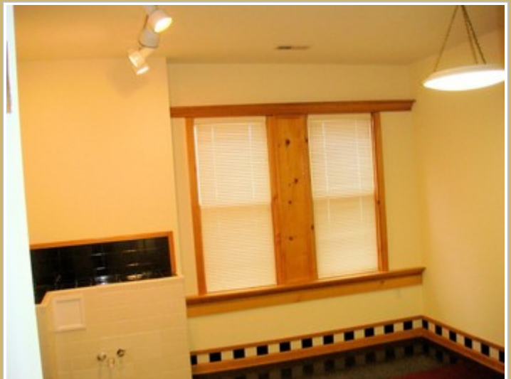
Suite 2 with Track Lighting

PAUL JANSEN | DAY - 919-833-7142 | PJANSEN@JANSENPROPERTIES.COM