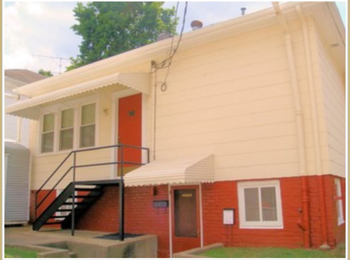
Rear Of Building With Entry Door