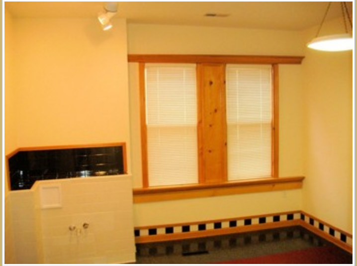
Suite 2 - Decorative Trim Wood