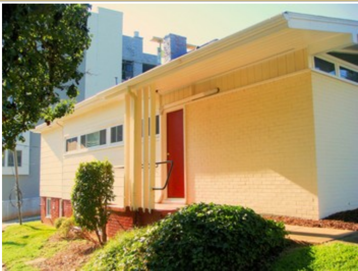
Side of Building with Side Entry Door