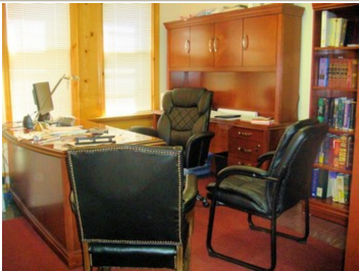
Desk and Chairs