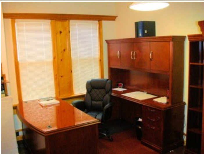
Desk & Credenza