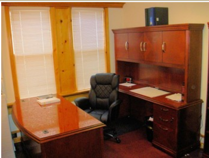
Suite 2 - With Furniture