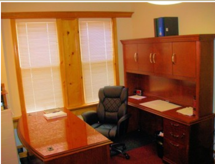
Plush Office with Desk and Credenza