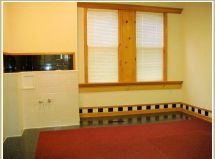
Suite 2 - Wall with Tile Border

PAUL JANSEN | DAY - 919-833-7142 | PJANSEN@JANSENPROPERTIES.COM