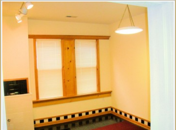
Suite 2 - With Overhead Track Lighting