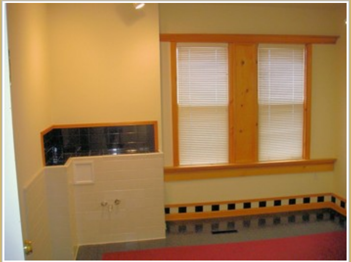
Suite 2 - Decorative Tile Wall