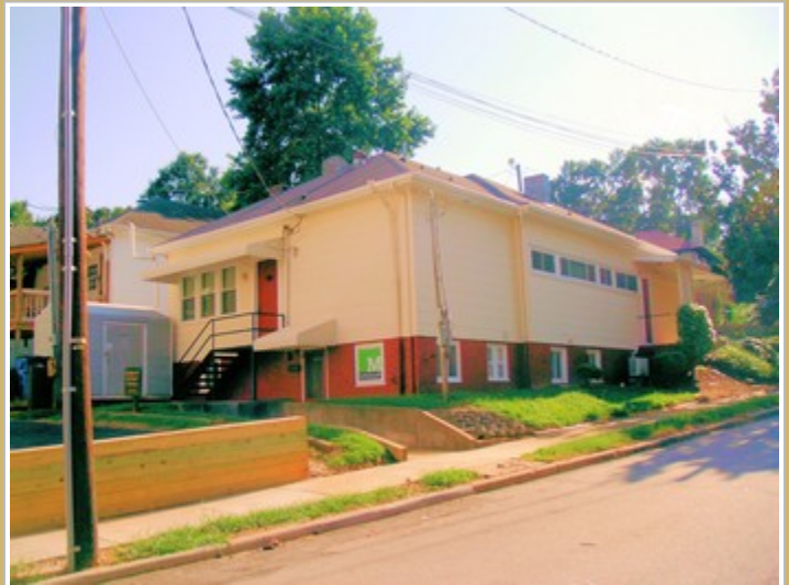
Rear Corner and Off Street Parking