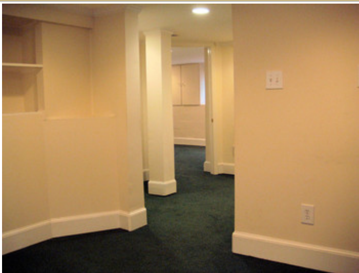
Office # 1 View of Hall