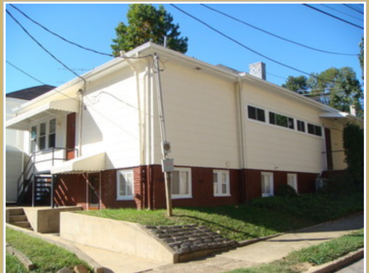
Rear Corner of Building

PAUL JANSEN | 919-833-7142 | PJANSEN@JANSENPROPERTIES.COM