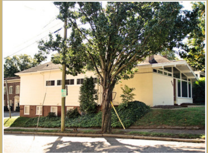
Side View of Building