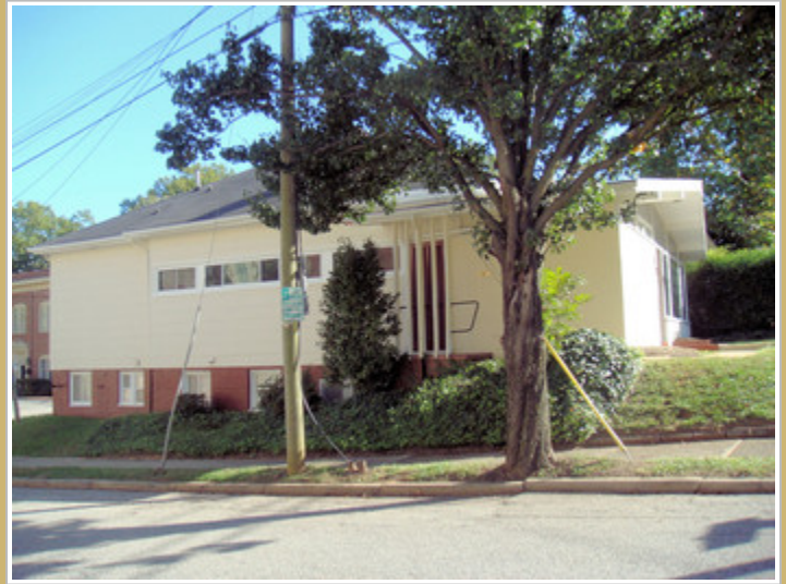
Side of Building