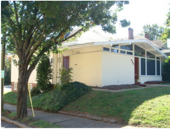
Front Corner Of Building