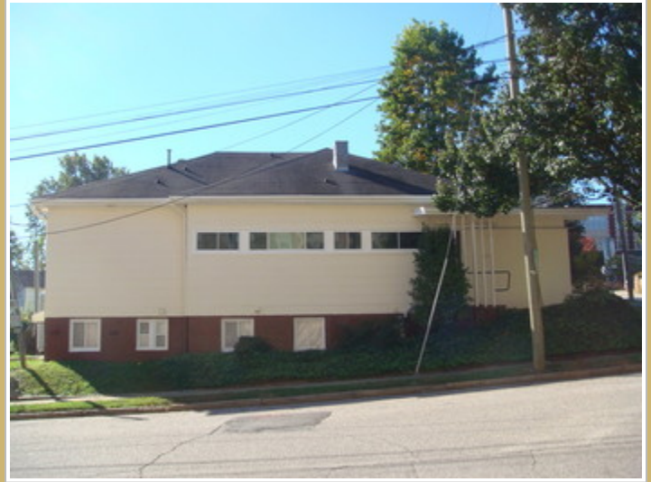
Side Of Building