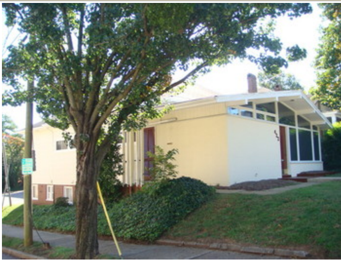
Front Corner View