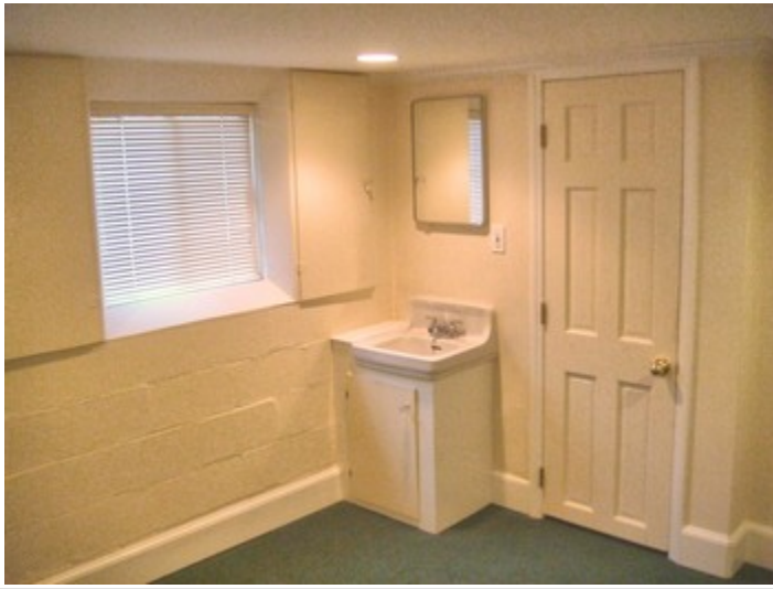
Office # 2