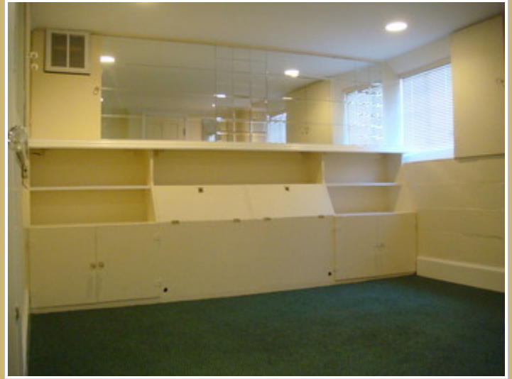
Office # 2