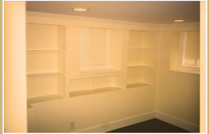
Office # 1 Shelving