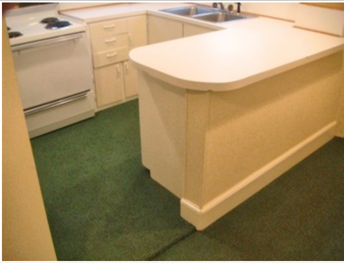
View of Kitchen Counter Top