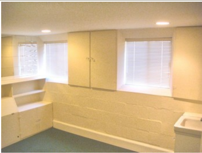
Office # 2 Outside Wall