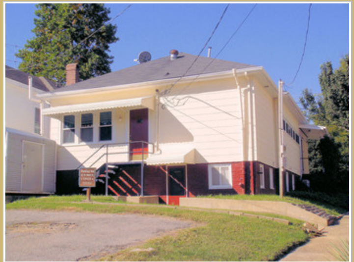
Rear of Building

PAUL JANSEN | 919-833-7142 | PJANSEN@JANSENPROPERTIES.COM