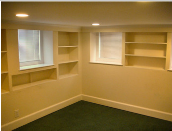
Office # 1