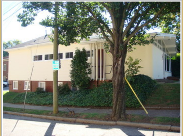
Side Of Building