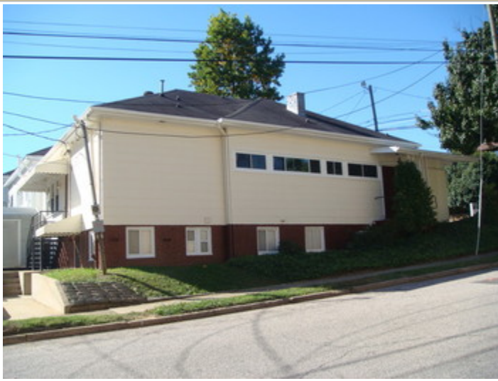
Rear Side of Building