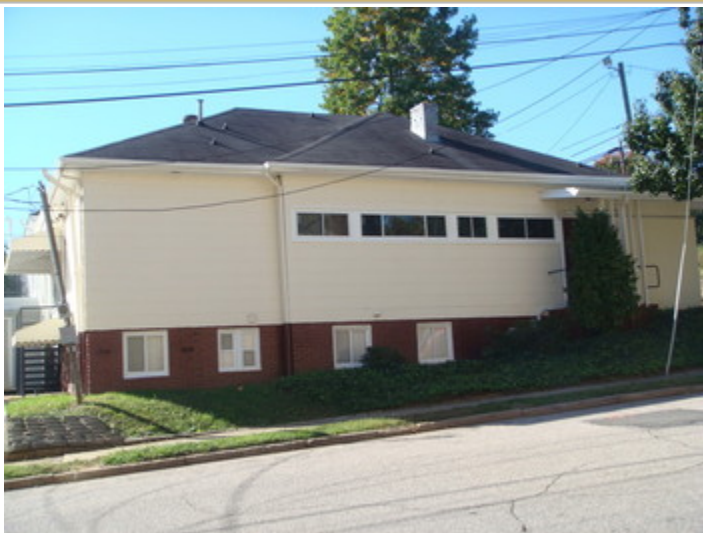
Another Side View