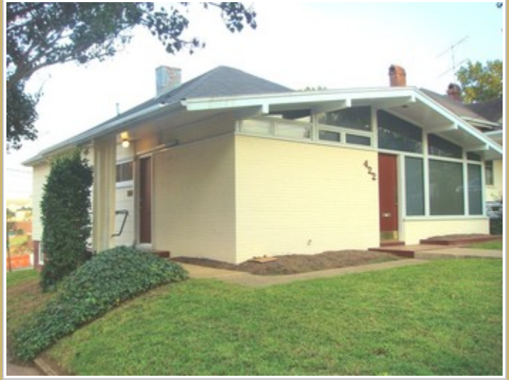
Front Corner of Building - Suite 6 Entry ...