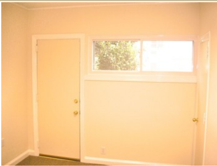
Office 1 - Vinyl Windows