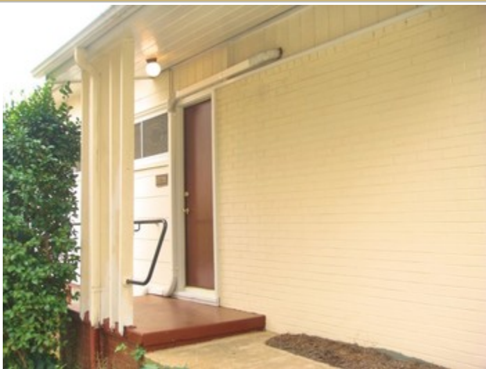
Private Entry Door to Suite 6