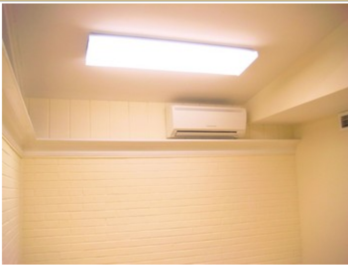
Office 2 - Additional Mitsibitshi HVAC U...