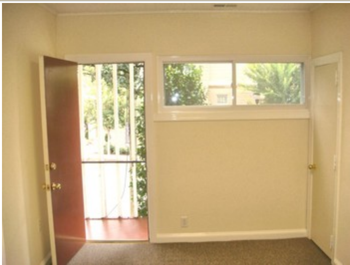
Office 1 with Private Entrance